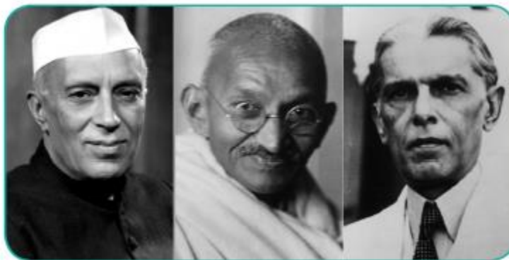
Nehru, Gandhi, Jinnah