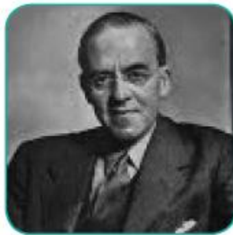
Sir Stafford Cripps