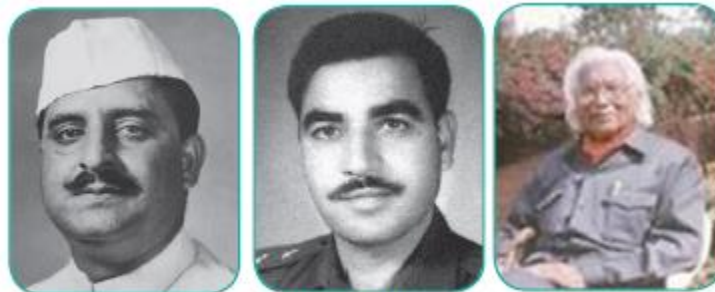
Shah Nawaz Khan