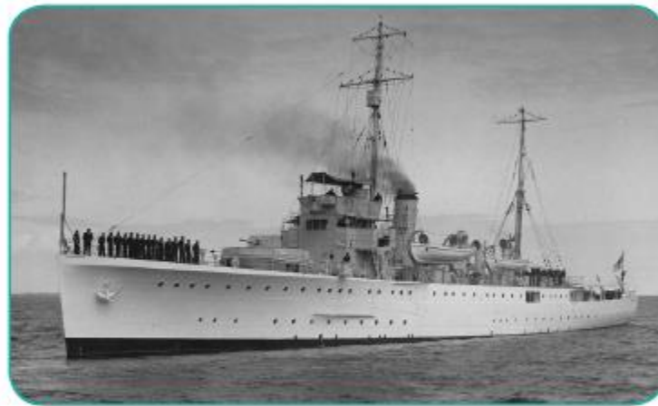
Royal Indian Navy Revolt