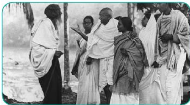
Gandhi in Naokhali