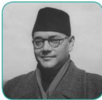
Subhas Chandra Bose