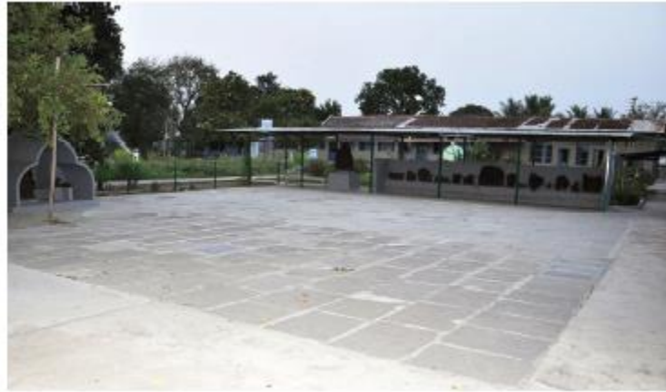
Paunar Ashram in Maharashtra