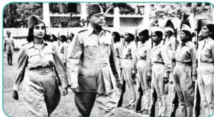
Bose with INA