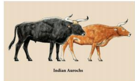
Indian Aurochs Bos Namadicus