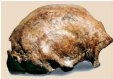
Hathnora archaic Homo sapiens fossil skull fragment