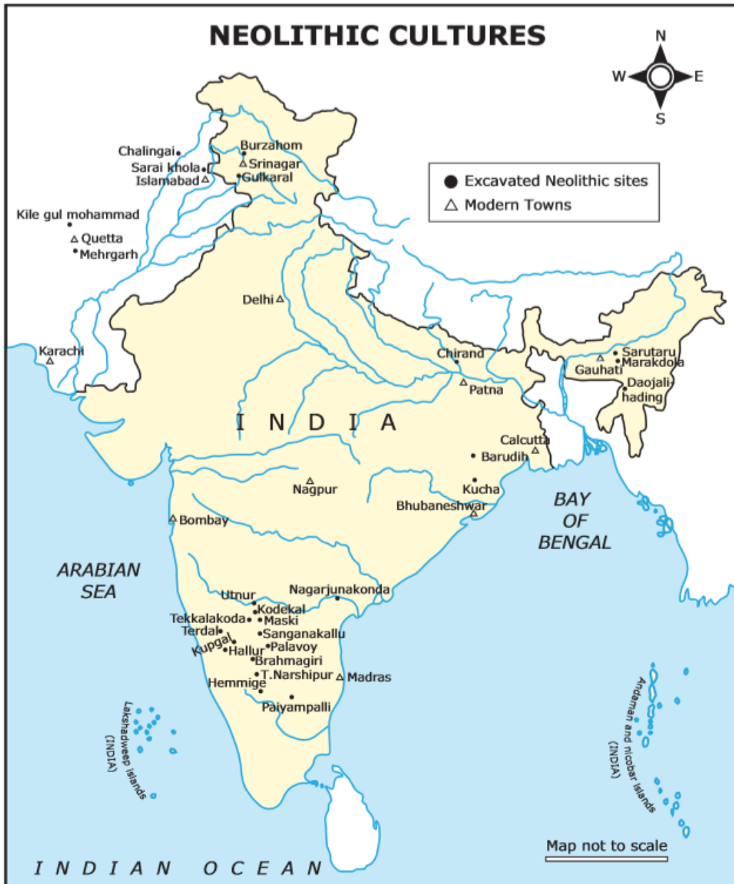
Neolithic sites of India.